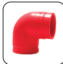
3/4" 90° ELBOW

Part #RP5203 = each Part #RP5203X = 10 pack