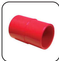
Pipe to Detector Adapter Part #RP5207 = each

Part #RP5209 = 8' Length Part #RP5209-15 = 15' Length