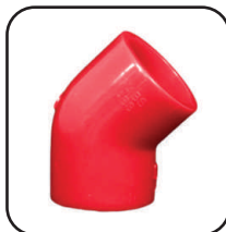
3/4" 45° ELBOW

Part #RP5203 = each Part #RP5203X = 10 pack