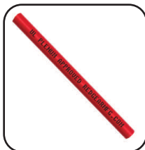
RedPipe 3/4" Smoke Detection

Part #RP5209 = 8' Length Part #RP5209-15 = 15' Length