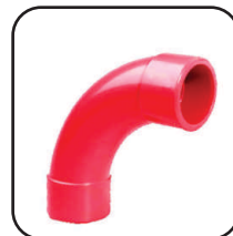
3/4" 90° Radius Bend

Part #RP5202 = each Part #RP5202X = 10 pack