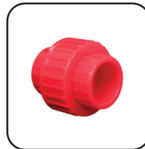
3/4" (27mm) ABS Union

Part #RP5205 = each Part #RP5205X = 10 pack